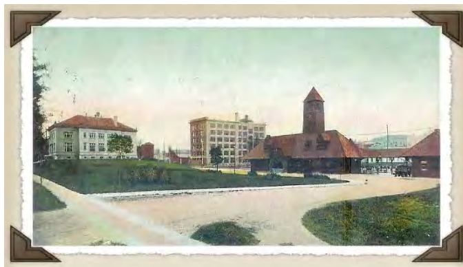
A 1908 postcard of Willard Library, the Ward Building and the Michigan Central Depot, now Clara's on the River.

Baked potatoes, scooped and fried until crispy, piled high with cheddar cheese and bacon. Served with sour cream and chives. $8.59