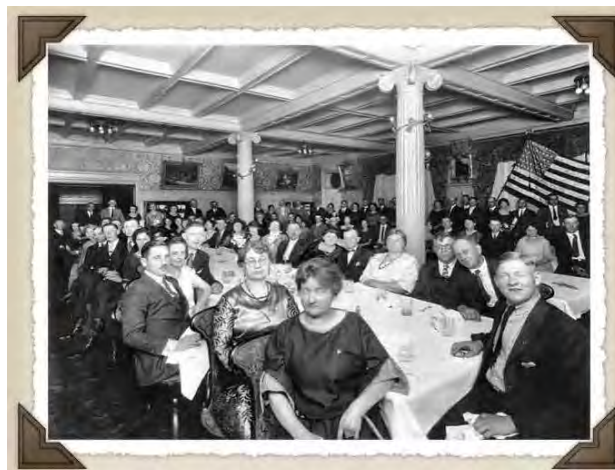
Banquet at the Post Tavern

Our secret recipe thin and crisp pizza dough is topped with only the freshest ingredients. We use fresh provolone cheese for a richer taste and creamier consistency you won't find in mozzarella. Clara's has a list of toppings to please everyone...prepared in a style all our own, and evenly distributed for more consistent flavor.