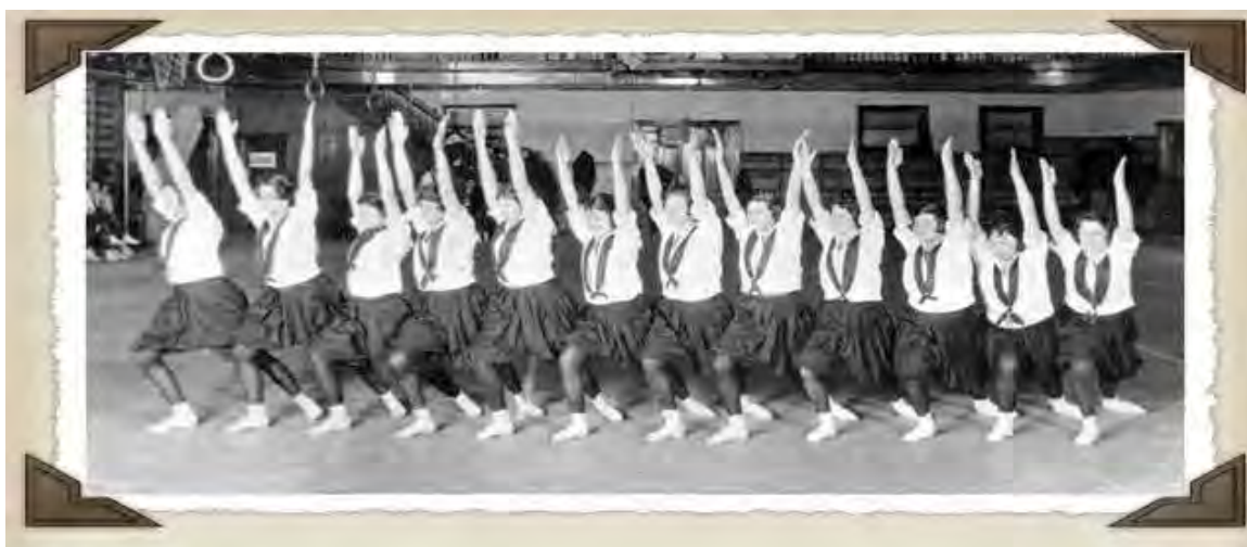
B.C. Sanitarium exercise class in the gymnasium, 1903.

* Notice: Can be cooked to order. Consuming raw or undercooked meat, poultry or seafood may increase your risk of food born illness.