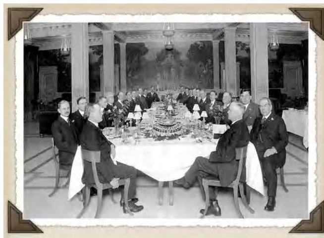
Banquet Room at the Kellogg Co. with W.K. Kellogg seated right-front.

Salad dressings include: Raspberry Vinaigrette, Ranch, French, Thousand Island, Parmesan Peppercorn, Bleu Cheese, Honey-Mustard-Ranch, Balsamic Vinaigrette, and Creamy Bacon dressing. Fat free dressings are: Italian, French, Thousand Island, Honey Dijon and Ranch.