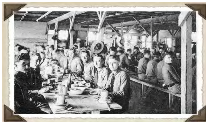
Noon Day mess at Camp Custer.

A basket of four of our delicious cheesy breadsticks with marinara sauce for dipping. $6.99