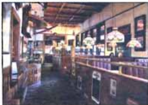
Sit and enjoy a few cocktails at Clara's.