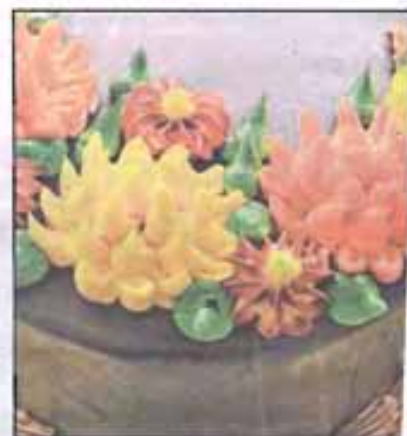
A chocolate cake at the Continental Bakery and Deli.