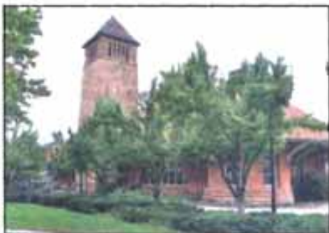
The exterior of Clara's on the River.

key to being a good hostess is remembering what people like when they walk in, such as where they like to sit and what they like to drink.