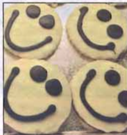
Happy face cookies are all smiles until they are eaten.